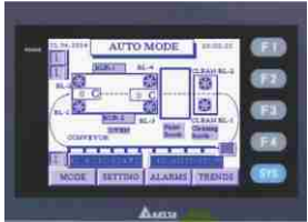
PLC / HMI TOUCH SCREEN