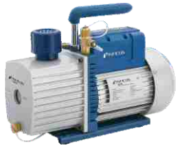
Vacuum Pump for Pre & Post Vacuum Cycle